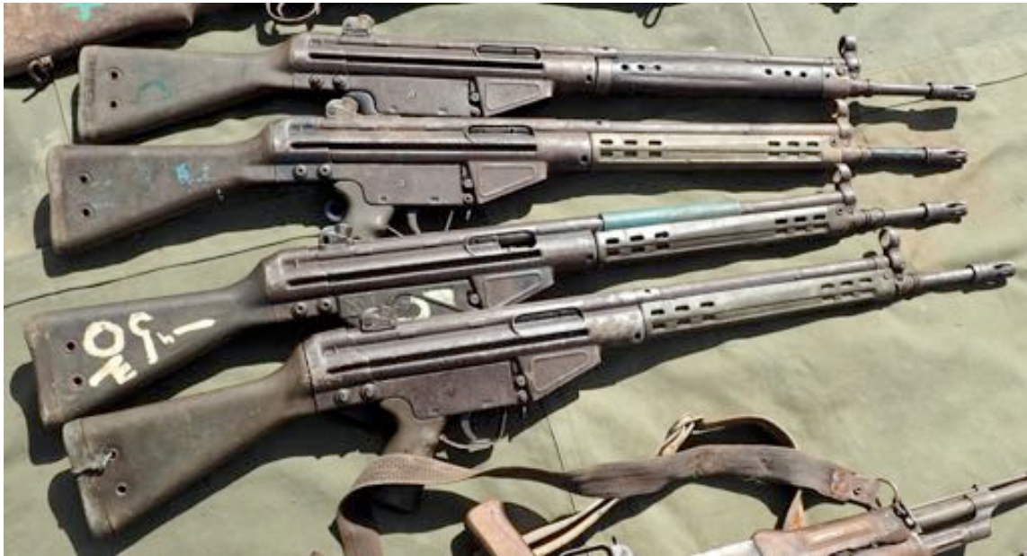
Heckler & Koch G3-type assault rifles prior to destruction

The destroyed sample also contained a number of Heckler & Koch G3-type assault rifles. Several countries produce G3-type assault rifles under licence agreements. In particular, one of the destroyed G3-type assault rifles was reassembled from two different models, originating in Iran and Portugal. As shown in the pictures below, the rifle had Farsi markings and a marking bearing three crossed weapons in a cogwheel on each side of the trigger assembly. These markings are consistent with Iranian-manufactured weapons. The serial number visible on the left side of the magazine catch (G3FMP025040), however, reveals the Portuguese origin of the barrel and receiver block of the weapon, with the marking FMP standing for Fábrica Militar Potuguesa, which is characteristic of G3-type rifles produced by Fábrica de Braço de Prata.