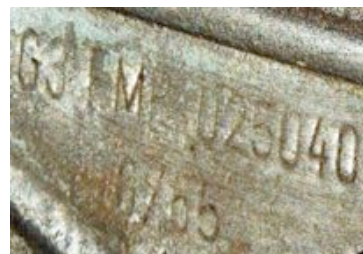
G3-type assault rifle produced in Iran and Portugal