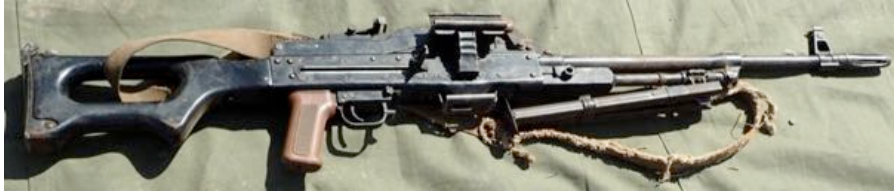
PKM-pattern general-purpose machine gun

The confiscated weapons to be destroyed included a few machine guns. UNMISS and UNMAS destroyed a PKM-pattern general-purpose machine gun and a Heckler & Koch HK 11A1 light machine gun (serial number 11A1 ENDL503378). The marking code suggests that the United Kingdom (UK)'s Royal Small Arms Factory of Enfield manufactured the weapon under Heckler & Koch's licence of over-sea production. The presence of the German Beschussamt Ulm (symbol right of the 'HL' marking) and of the German definitive nitro proof mark (left of the 'HL' marking) suggests that, as per the terms of the licence agreement, Germany produced some of the weapon's parts before being sent for assembly in the UK.