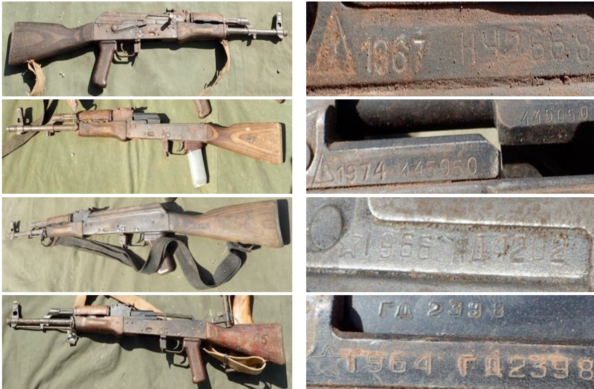
AK-pattern assault rifles prior to destruction

Some AK pattern assault rifles were produced in other countries such as Bulgaria, Poland, and China.