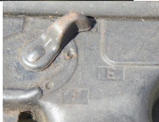
Heckler & Koch HK 11A1 light machine gun