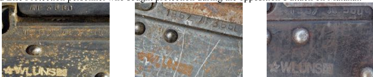
Markings consistent with those in use in the South Sudan Wild Life Protection Services, bearing a star, the letters WL (for Wild Life) and UNS (for Upper Nile State) and a dot matrix code.

At least three of the AK-type rifles bore markings consistent with those used to mark the stockpile of the Upper Nile State's Wild Life Protection Services, during the marking program supported by the Regional Centre on Small Arms in 2011. Due to the lack of information, it is impossible to determine whether the rifles were collected from defectors who joined the opposition with their arms or from Wild Life Protection personnel who sought protection during the opposition's attack on Malakal.