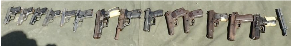
Pistols prior to destruction

The destroyed sample also contained 14 pistols of different models, ranging from a starter automatic pistol to modern semi-automatic pistols produced in China, Germany, and Israel. Conflict Armament Research has sent tracing requests to the governments of Germany and Israel to establish the chain of custody of the following destroyed pistols: a German Walther P22 semi-automatic pistol (serial number GO29301); a West German Sig Sauer P226 semi-automatic pistol (serial number U405371); and an Israeli Jericho 941 PSL semi-automatic pistol (serial number 41307617).