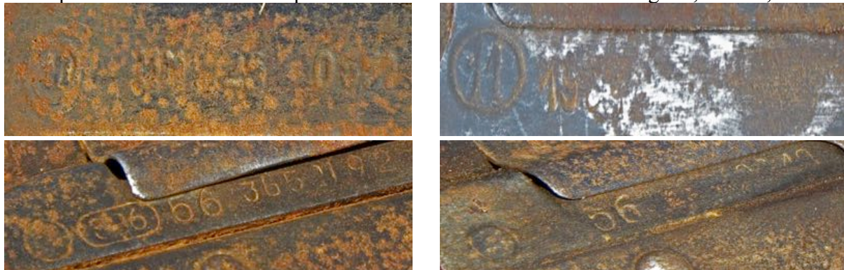
Markings consistent with AKs manufactured in Bulgaria (top left), Poland (top right), and with Type 56 assault rifles produced in China (bottom)

Some AK pattern assault rifles were produced in other countries such as Bulgaria, Poland, and China.