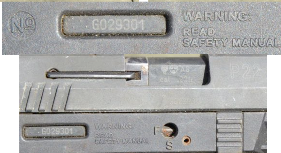
German Walther P22 semi-automatic pistol