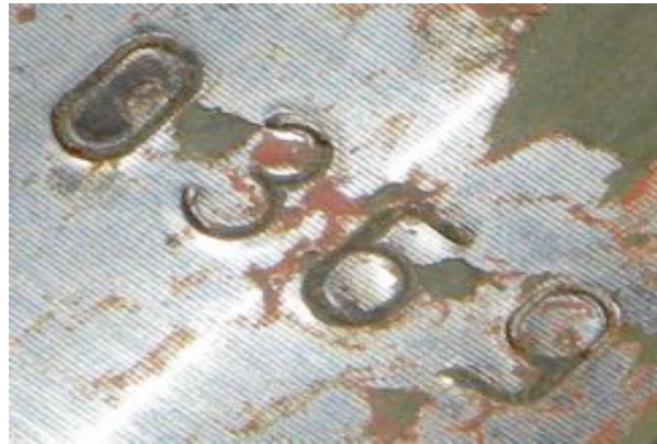
Unknown mortar tube