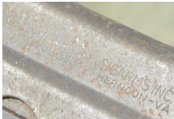
West German Sig Sauer P226 semi-automatic pistol