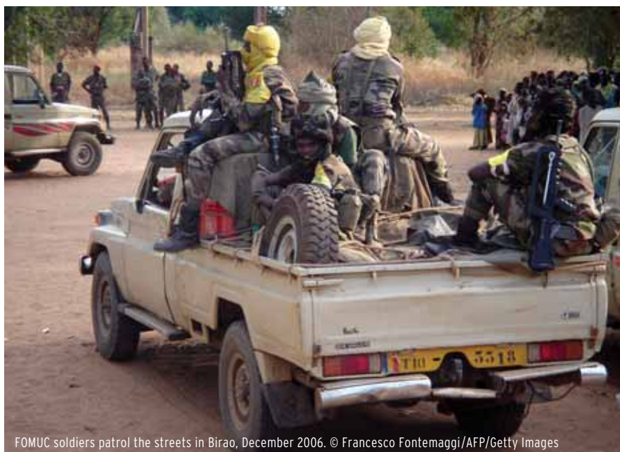
FOMUC soldiers patrol the streets in Birao, December 2006.

Armed violence in the north-west of CAR, particularly near Poaua, escalated in the latter half of 2005. Because Poaua is Patassé's home area, Bozizé and Déby regard its people with intense suspicion. Déby posted soldiers along the border to quell any potential upris-