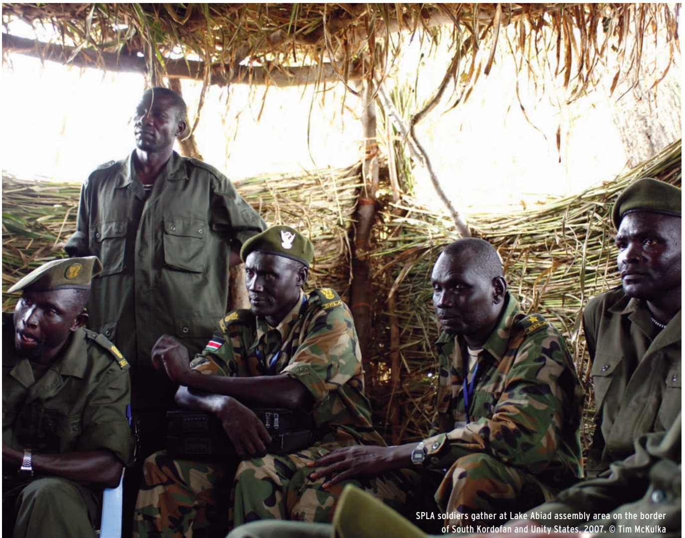
SPLA soldiers gather at Lake Abiad assembly area on the border of South Kordofan and Unity States, 2007.

Morale is low among the 3,000 men who form the SPLA component of the JIUs and who have not, according to their commander, 'received a single bullet' from the government. 52 Intended by the CPA to act as 'a symbol of national unity,' should the 2011 referendum indicate a desire for unity, the JIUs are instead a symbol of continu-