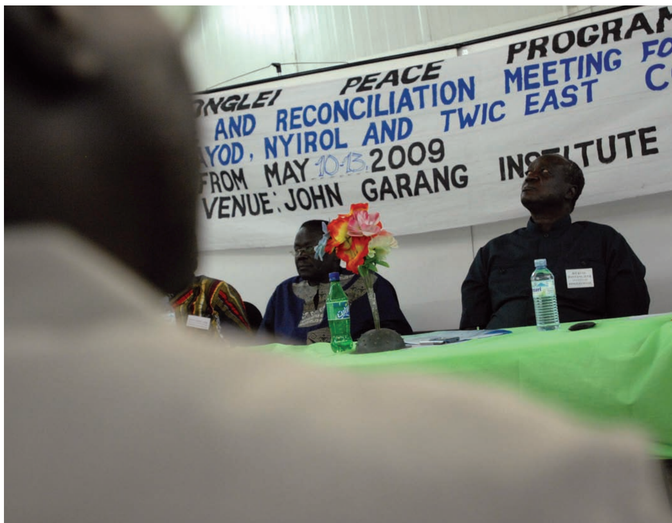
▲ Tribal peace and reconciliation conference, Jonglei, May 2009

As these steps suggest, re-emphasizing peace-building and both state and human security is essential. The