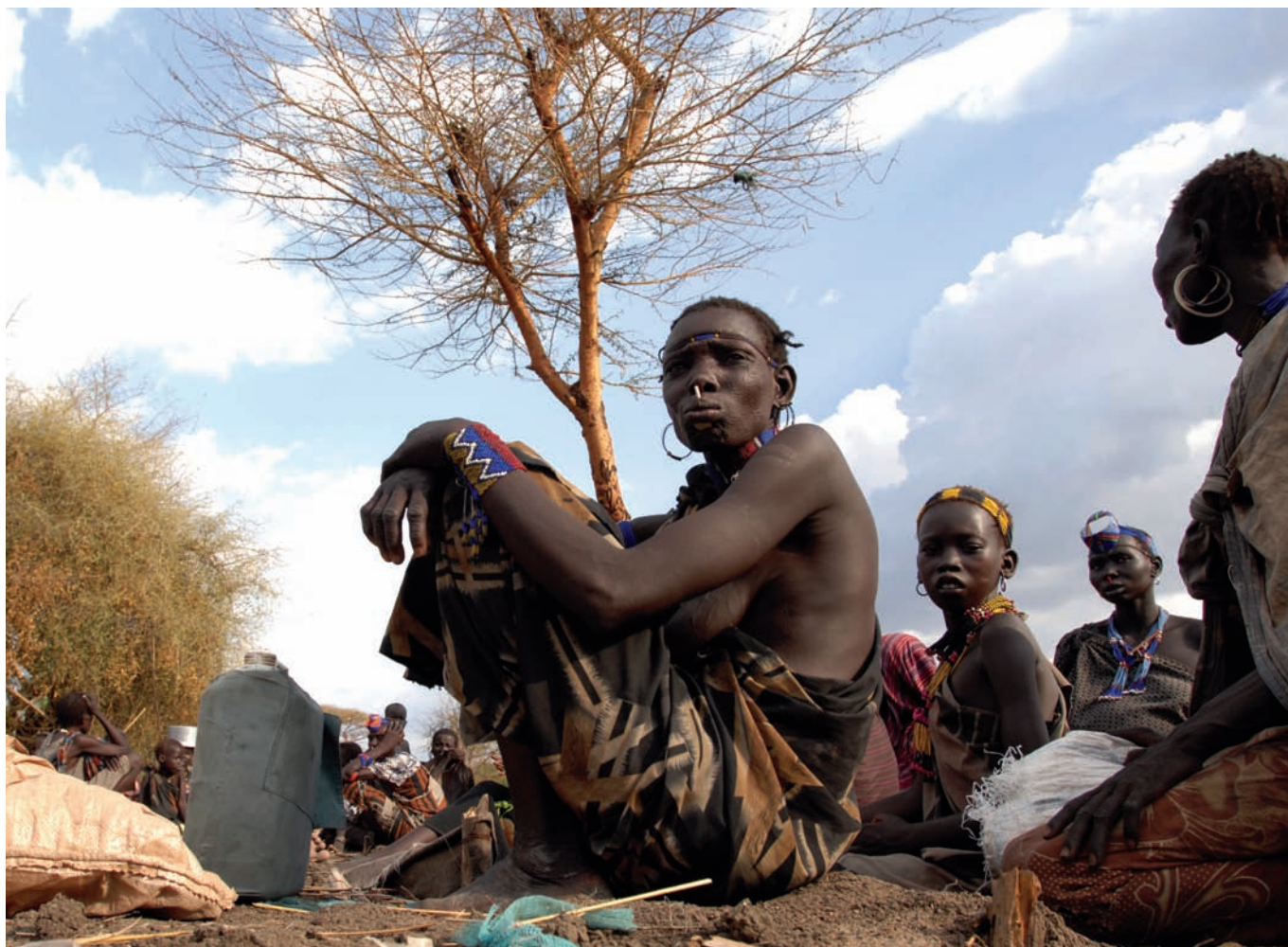
▲ Displaced Murle rest after attacks by Lou Nuer drove them from home in Pibor County, Jonglei, 21 March 2009.

the 2008 campaign had very little impact on the internal security dynamics within Southern Sudan. There were instances of abuse committed under the auspices of civilian disarmament, but the effort did not lead to violence on the scale of the 2005–06 campaign. Indeed, its implementation was relatively peaceful, though largely due to its cautious and patchy implementation, not as a result of a fundamental change of strategy on the part of the GoSS. All indications are that the government plans to continue civilian disarmament in 2009, by force if necessary. 82