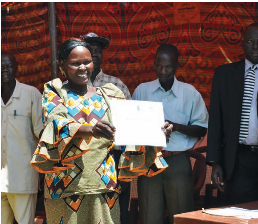
▲ Reintegration graduation ceremony, Juba, South Sudan, 4 November 2010.

Understanding the SPLA's sense of loyalty and responsibility to its soldiers and its belief that these soldiers should be rewarded after leaving the army is key to approaching demobilization in South Sudan. The current programme's failure to acknowledge these principles means that it will not process the 'ex-combatants' whom the programme professes to demobilize and reintegrate. There is a need for a