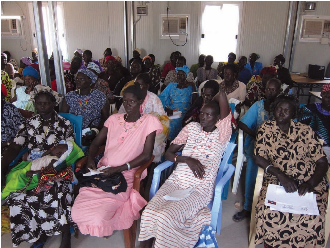
▲ Women going through demobilization, Rumbek, South Sudan, 23 March 2010.