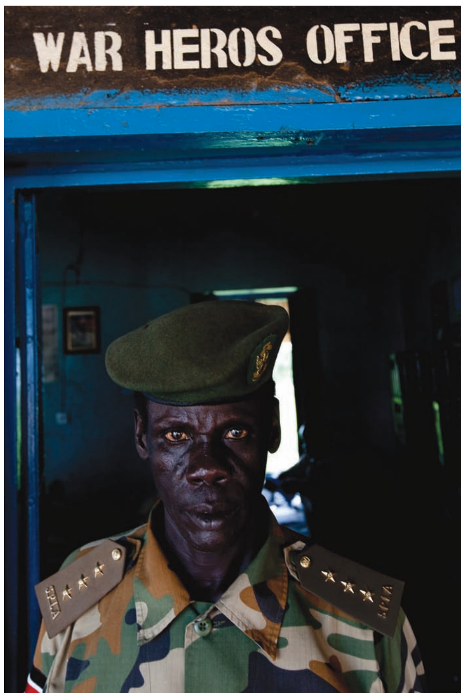
▲ An SPLA veteran visits the War Heroes office at the Yei army barracks, South Sudan, May 2010.

Thus, while the SPLA has complied with DDR, it has done so only to its own narrow advantage, not to downsize its fighting force, but to abide by the letter of the CPA and offer benefits